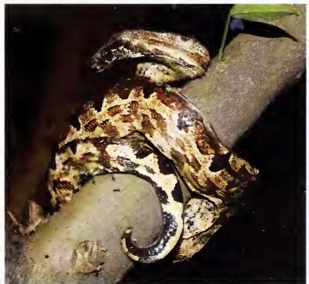
Fig. 16. Candoia paulsoni tasmai (MZB Serp. 2950) from Karakelong Island.